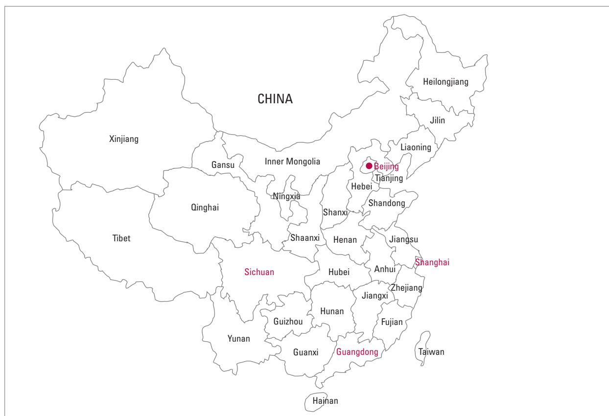
Figure 2-2: Regions where there is particularly strong activity in environmental goods and services